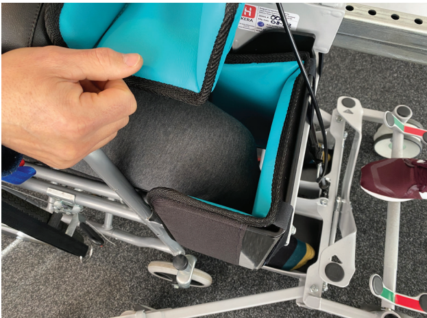
3. Ensure the knees are touching (or within 3cm) of the Knee Support Cover